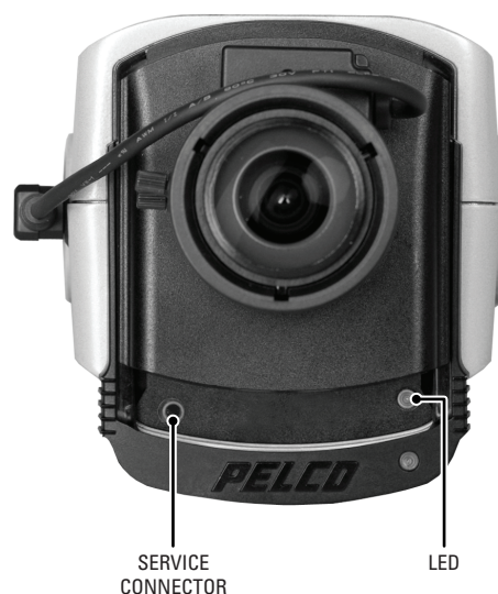
FRONT VIEW, CAMERA ONLY (OPENED TO EXPOSE SERVICE CONNECTOR)