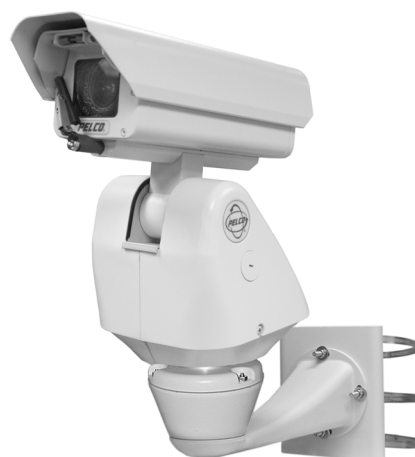
ESPRIT IOP SYSTEM WITH WIPER (SHOWN WITH WALL MOUNT AND POLE ADAPTER)

Pelco's ES30C/ES31C Esprit® Positioning System features a receiver, pan/tilt, enclosure, and Integrated Optics Package (IOP) in a single, easy-to-install system. The IOP contains an autofocus camera and lens module with programmable features.