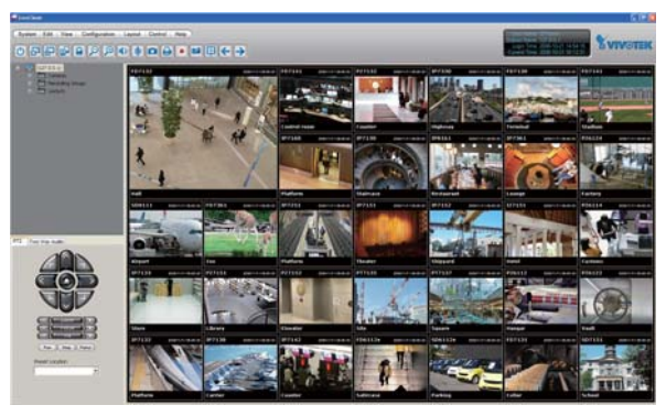
32-channel Live Video Monitoring